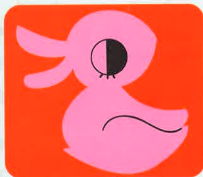
Two faces or a vase? A duck or rabbit?