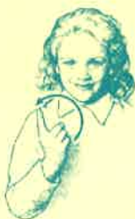
at all times