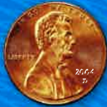
A PENNY is worth 1 cent