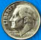
A DIME is worth 10 cents