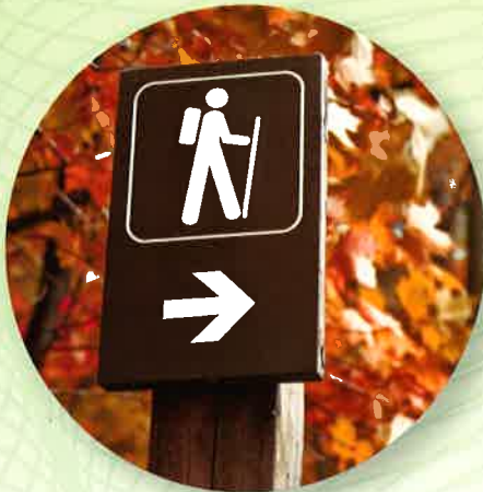
Take a walk or go on a hike