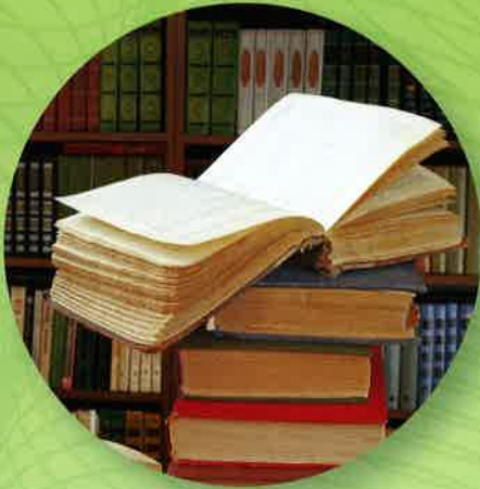
Check out a book or movie from the library

Circle the pictures that show fun things that you and your friends or family could do for free .