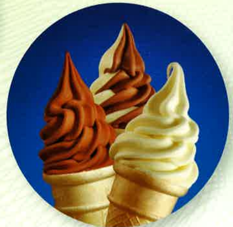
Get ice cream cones