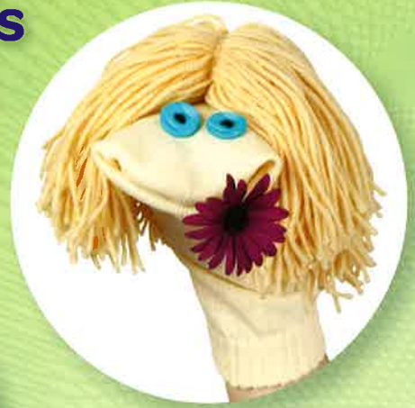
Put on a puppet show