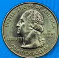
A QUARTER is worth 25 cents

Complete all three steps to earn this leaf.