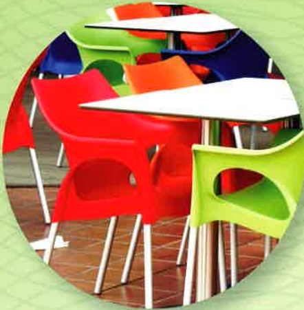
Eat at a restaurant