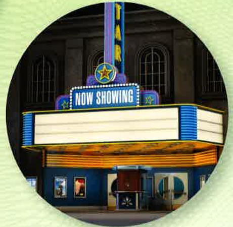
Go to the movies