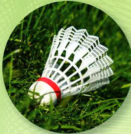
Play games in the backyard