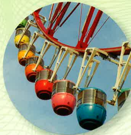
Visit an amusement park