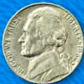
A NICKEL is worth 5 cents