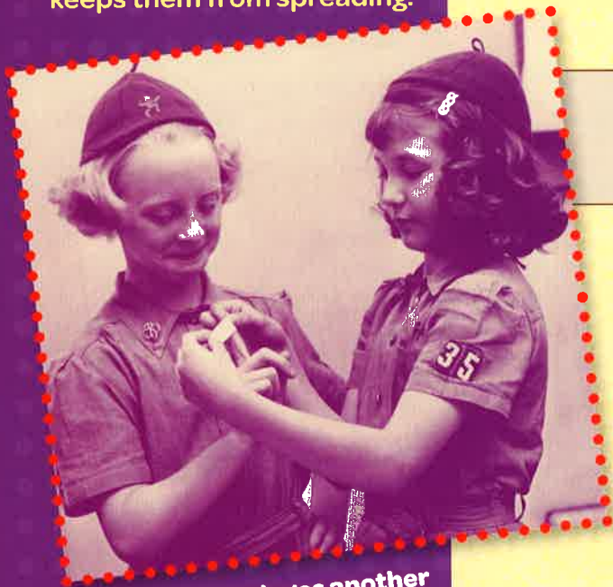
A Brownie bandages another Brownie in the 1950s.

Go inside! See if the EMT will show you the inside of an ambulance and how injured people are treated.