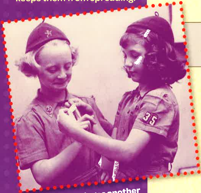
A Brownie bandages another Brownie in the 1950s.

Go inside! See if the EMT will show you the inside of an ambulance and how injured people are treated.